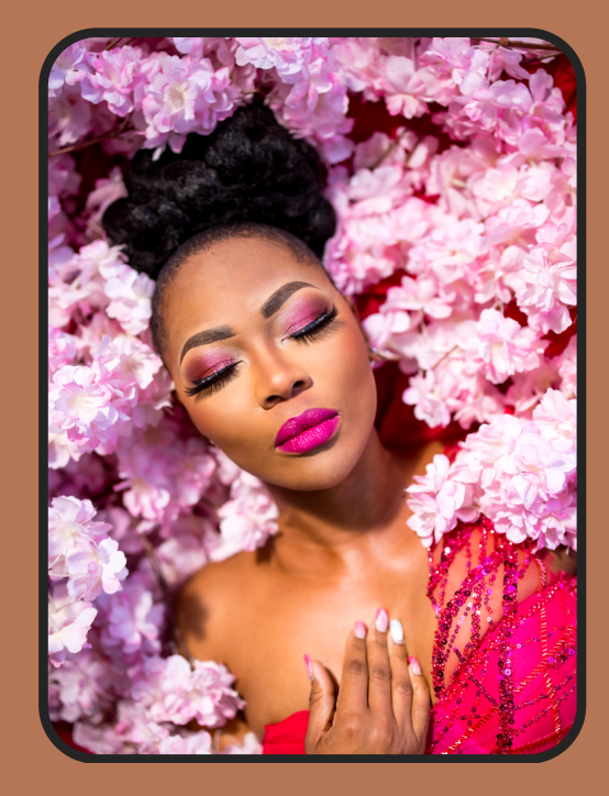
Photoshoot Makeup (Studio or Venue) 1 Hour