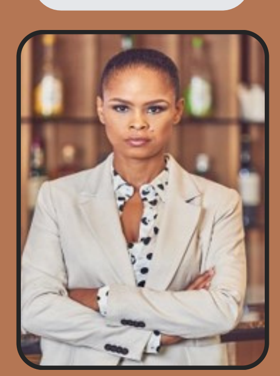
Corporate Makeup (Studio or Venue) 1 Hour