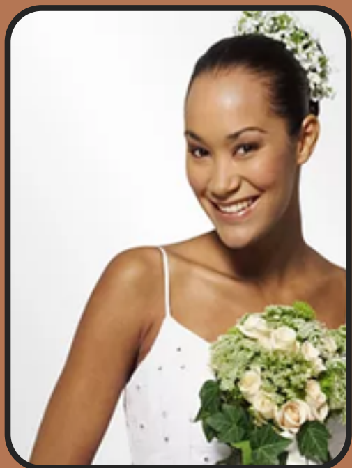
Bridesmaids Makeup 1 Hour