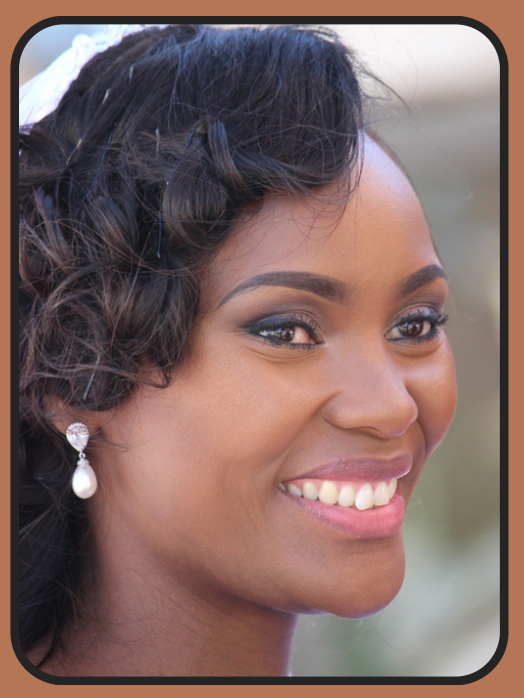
Bridal Trial Makeup (Our Studio) 2 Hours