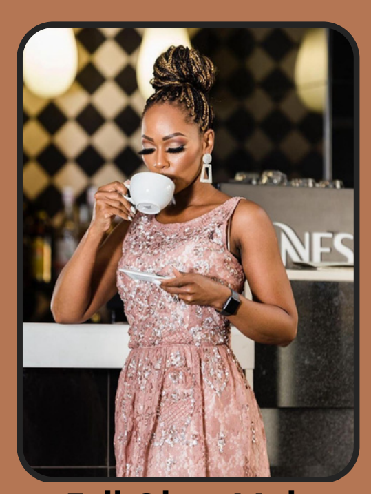
Full Glam Makeup (Studio) 1 Hour