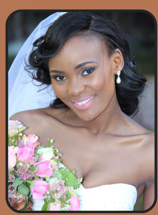
Bridal Makeup (On the Day) 2 Hours